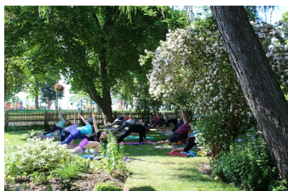
2016 Yoga In the Garden, in partnership with Durham Yogi Community.

7% yearly increase in Oshawa Historical Society Memberships: 175 Memberships at year's end