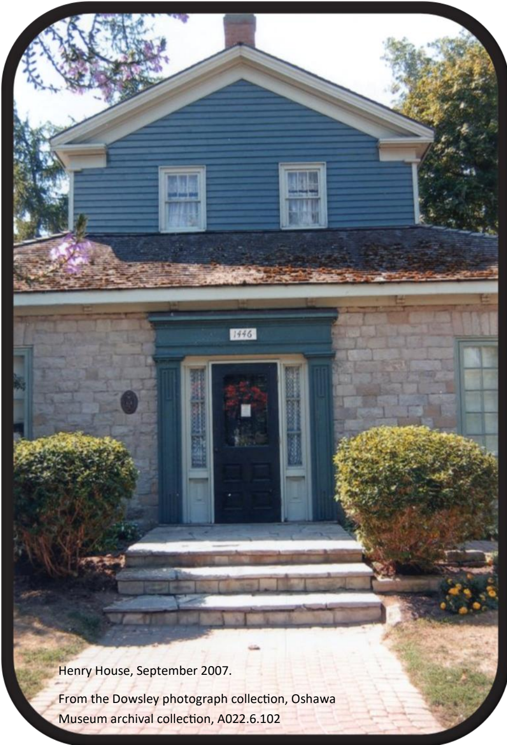
Henry House, September 2007.

From the Dowsley photograph collection, Oshawa Museum archival collection, A022.6.102